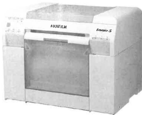
Figure 1. FujiFilm DX100

from small enough to fit on a desk to larger freestanding printers. 33 New Hampshire technicians routinely serviced desktop printers such as the FujiFilm Frontier Series DX100 pictured below in Figure 1 . 34 The photo-processing printers are large printers used in retail stores to print photos for customers from digital files. 35 The larger freestanding printers are similar in size to a copy machine. The Frontier LP5700 shown in Figure 2 below is an example of one of the photo lab printers serviced by New Hampshire technicians. 36 The photo kiosk, Figure 3 below, consists of a computer, screen, and printer assembled together in a freestanding cabinet for customer self-service. 37 The vending machines are large freestanding vending machines that contain various merchandise such as cosmetics, skin care products, toiletries, prescription medications, and other items. 38 The Proactiv ® vending machine pictured below in Figure 4 is one type of vending machine frequently serviced by New Hampshire technicians. 39 The packaging machines consist of large freestanding equipment used to automate various tasks in pharmacies. 40