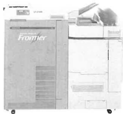
Figure 2. Frontier LP 5700