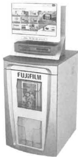
Figure 3. Photo Kiosk