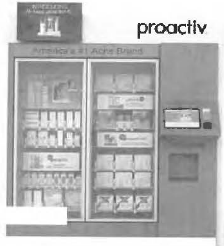
Figure 4. Proactiv® Vending Machine

Technicians use basic hand tools such as screwdrivers, wrenches, voltage meters, etc. to install new equipment and perform general service and maintenance of equipment. 41 Service consists of repairing and replacing rollers, gears, belts, and electronic readers. 42 CES technicians do not deliver or move equipment and do not lift any equipment over 50 pounds. 43 Technicians working on the retail side of the business are not trained on the commercial graphics equipment's and do not take service calls for this equipment. 44