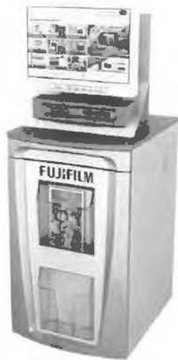
Figure 3. Photo Kiosk