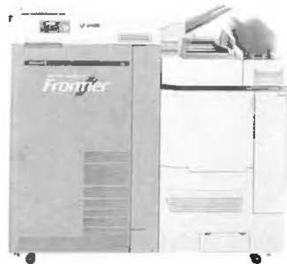
Figure 2. Frontier LP 5700