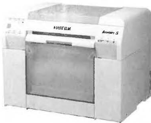
Figure 1. FujiFilm DX100

from small enough to fit on a desk to larger freestanding printers. 33 New Hampshire technicians routinely serviced desktop printers such as the FujiFilm Frontier Series DX100 pictured below in Figure 1 . 34 The photo-processing printers are large printers used in retail stores to print photos for customers from digital files. 35 The larger freestanding printers are similar in size to a copy machine. The Frontier LP5700 shown in Figure 2 below is an example of one of the photo lab printers serviced by New Hampshire technicians. 36 The photo kiosk, Figure 3 below, consists of a computer, screen, and printer assembled together in a freestanding cabinet for customer self-service. 37 The vending machines are large freestanding vending machines that contain various merchandise such as cosmetics, skin care products, toiletries, prescription medications, and other items. 38 The Proactiv® vending machine pictured below in Figure 4 is one type of vending machine frequently serviced by New Hampshire technicians. 39 The packaging machines consist of large freestanding equipment used to automate various tasks in pharmacies. 40