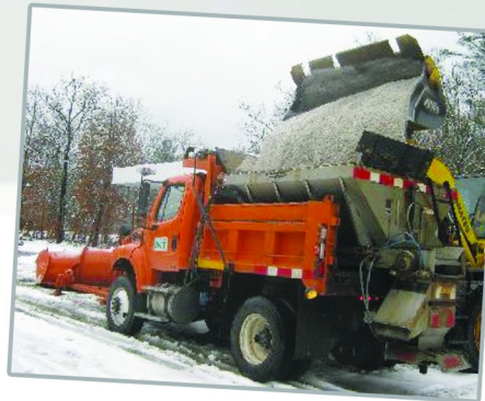
Left: Salt gets loaded into an NHDOT plow truck