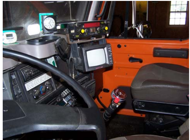
Figure 13: District 4 Monitor

The camera system in District 5 was mounted on a Komatsu front-end loader. This loader does a considerable amount of plowing on I-93 ramps south of Manchester and is required to perform multiple backing maneuvers. The camera is a Safety Vision SV523B color camera and the monitor is a Safety Vision SVLCD56 5.6 inch color monitor. The camera was mounted at the bottom center of the radiator grille and the monitor was mounted on the window ledge to the left of the steering column. In Figure 16, the monitor view is shown with green range markers visible to aid the driver in estimating distances.