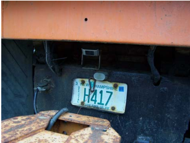
Figure 10: District 3 Camera

dashboard. This truck has a plow route in Alton, NH and is required to perform several backing maneuvers during the course of its route. The monitor and camera are mounted in the same positions as the District 2 truck.