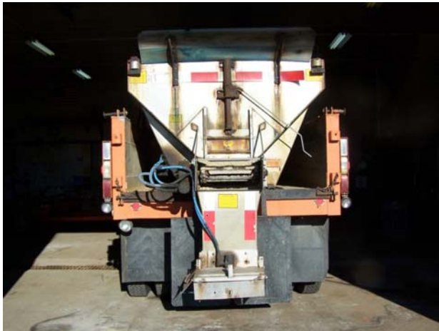
Figure 23: District 3 truck with spreader