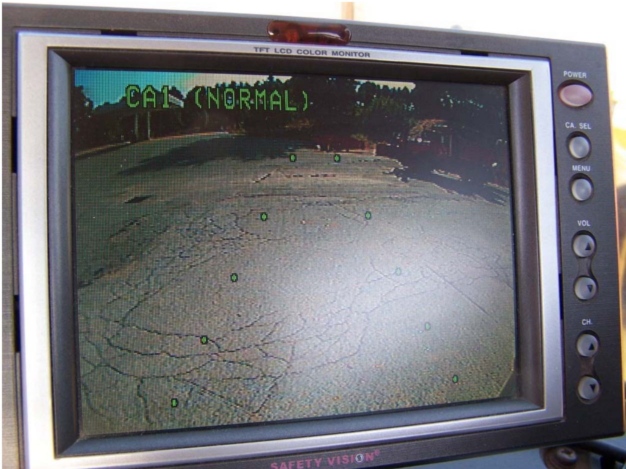
Figure 16: District 5 monitor showing range marks

The camera system in Maintenance District 6 was installed on a Freightliner six-wheel dump truck with a municipal body. This truck plows a route on US 1 that includes many intersections where the truck must back frequently. The camera is an Intec CVC470HXL color camera and