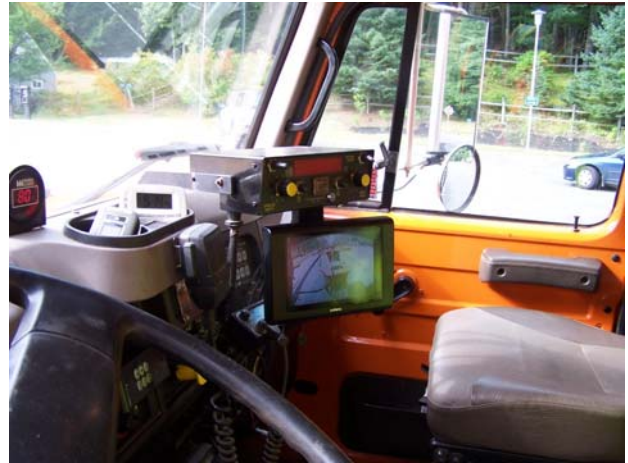
Figure 11: District 3 Monitor

The camera system in Maintenance District 4 was installed on an International 4900 six-wheel dump truck. This system is a Safety Vision SV500A black/white camera and a Safety Vision SV511 black/white monitor. The camera was mounted below the right side taillights on the side of the body. The monitor was mounted in the cab on the dashboard between the seats similar to those in District 2 and 3.