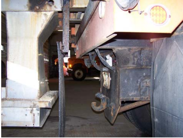
Figure 25: Position of spreader and camera