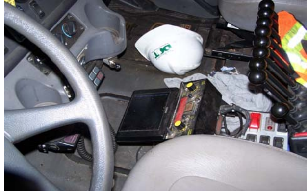
Figure 18: District 6 Monitor

The Bureau of Turnpikes, which is responsible for plowing several sections of interstate highway, received a camera system on a Freightliner six-wheel dump truck that operates out of the Hampton shed. This truck plows several ramps and also is required to back a quarter of a mile at one point on its route. The camera on this truck is an Intec CVC500AH color camera, the monitor is an Intec CVD500LCD color monitor, and the controller is an Intec CVS100H with a CVR100 remote control. This camera has a microphone for one-way audio so that the driver can hear what is going on behind the vehicle. The camera was mounted in the center of the truck above the pintle plate and below the body. The monitor was mounted on the dashboard between the seats.