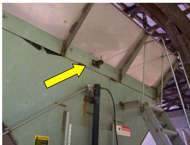
Figure 29: Attachment point location on spreader

Bow equips their trucks with shuttered cameras to keep the lenses from getting obscured with snow. This is consistent with NHDOT's experience where shuttered lenses performed better than non-shuttered lenses in inclement weather. The Town has also experimented with the radar systems but does not install them as part of their program. There is a fear among managers that driver dependence on the radar could lead to bad habits or incautious backing. Finally, the Town uses only one brand of camera on its vehicles. The benefit of this approach is that there are spare parts available and the cameras can be interchanged from vehicle to vehicle.