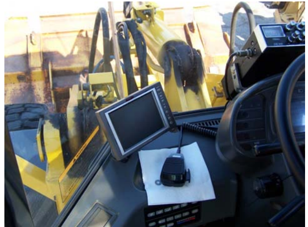
Figure 15: District 5 Monitor