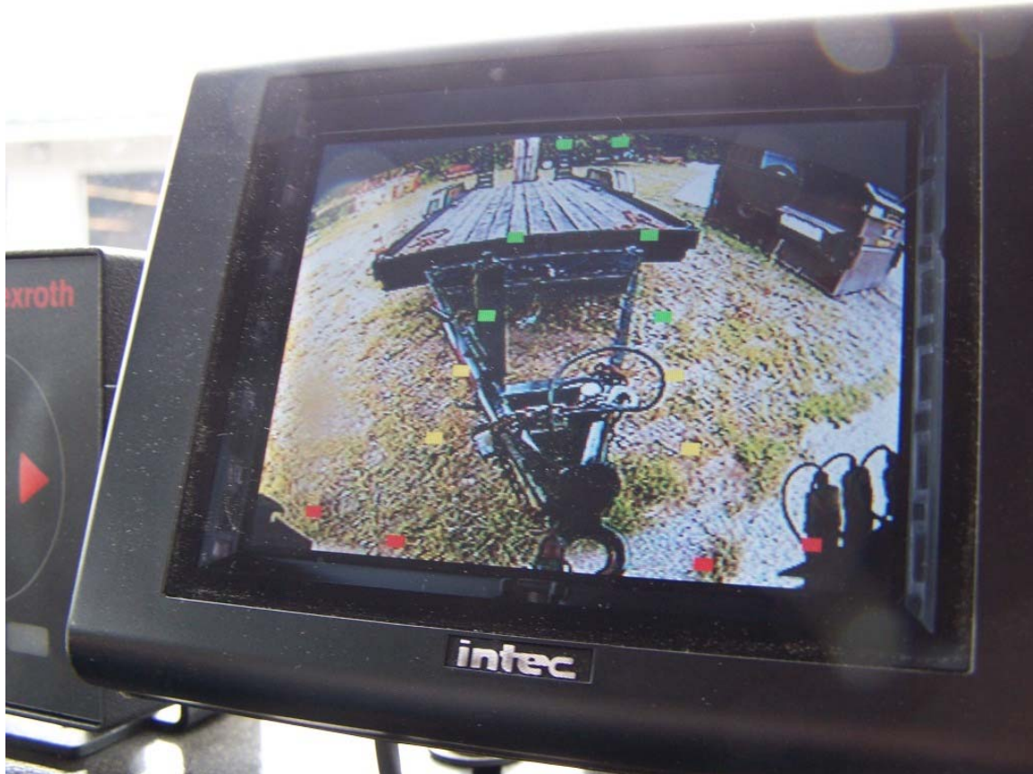
Figure 21: Turnpikes' monitor showing truck backing to trailer

For more details on each of the camera systems described above, please see Appendix B of this report.