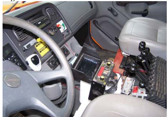
Figure 6: District 1 Monitor