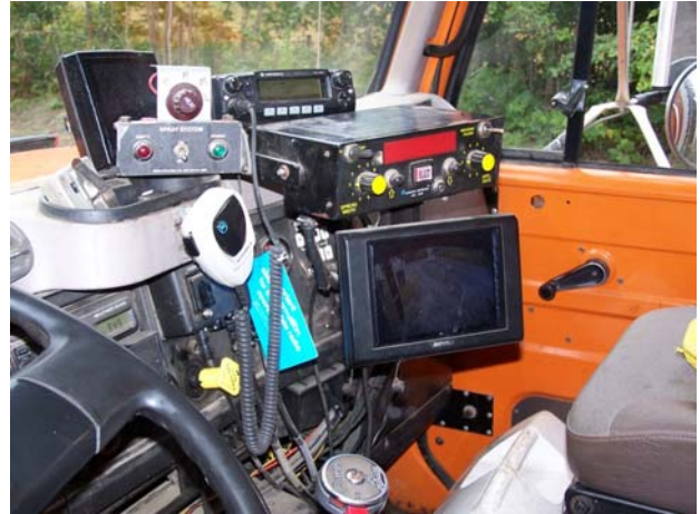
Figure 8: District 2 Monitor