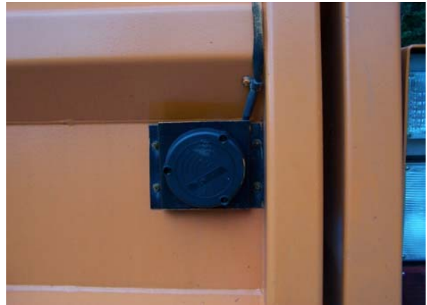
Figure 5: District 1 Sensor