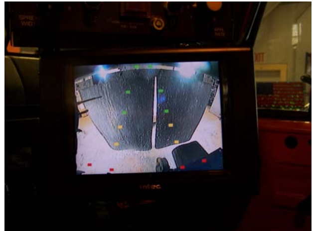
Figure 24: View with mud flaps down