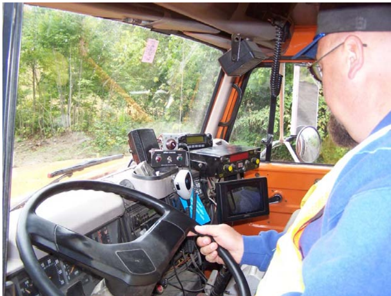
Figure 9: District 2 monitor during backing

In NHDOT Maintenance District 3 an International 4900 six-wheel dump truck received an Intec CVC470HXL camera, an Intec CVD640LCD 6.4 inch LCD display, and an Intec CVS100XL single channel controller with the CVR100 remote control. The remote is mounted to the