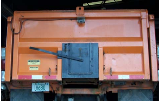
Figure 17: District 6 Camera

was mounted on the tailgate in the same position as the camera on District 1's truck. The monitor is an Intec CVD640LCD 6.4 inch color display mounted in the cab on the floor between the seats. This truck has the Intec CVS100XL single channel controller with the CVR100 remote control.