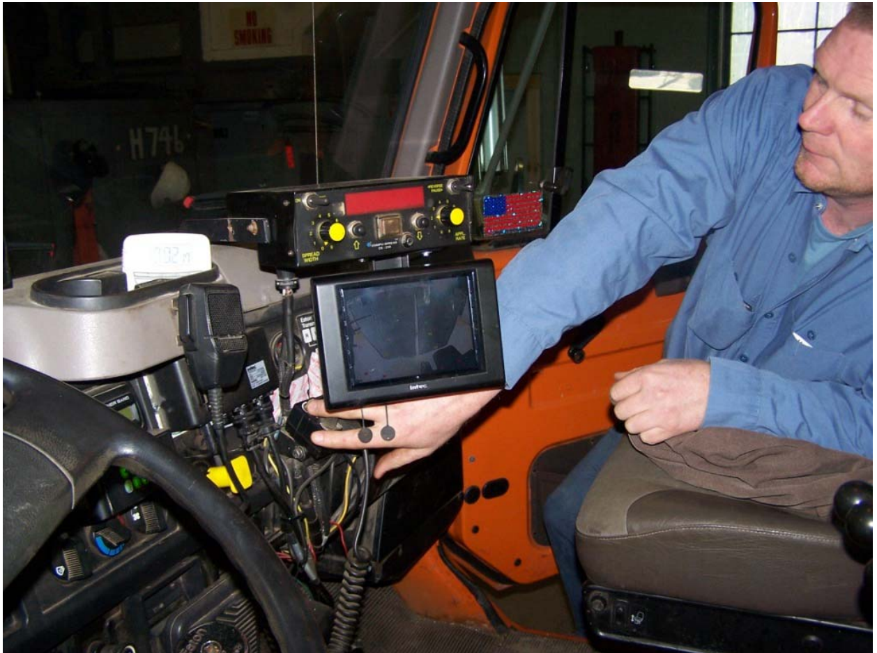
Figure 22: Districts 2 and 3 have to reach under the display to access their state radios