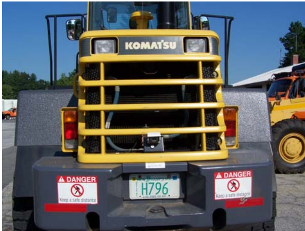
Figure 14: District 5 Camera