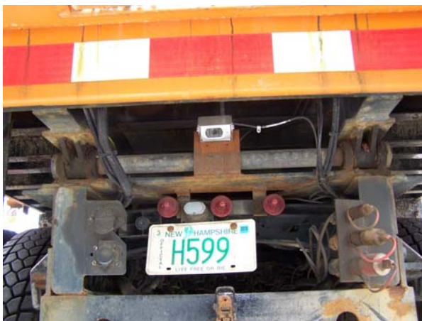
Figure 19: Turnpikes' Camera

The Bureau of Turnpikes, which is responsible for plowing several sections of interstate highway, received a camera system on a Freightliner six-wheel dump truck that operates out of the Hampton shed. This truck plows several ramps and also is required to back a quarter of a mile at one point on its route. The camera on this truck is an Intec CVC500AH color camera, the monitor is an Intec CVD500LCD color monitor, and the controller is an Intec CVS100H with a CVR100 remote control. This camera has a microphone for one-way audio so that the driver can hear what is going on behind the vehicle. The camera was mounted in the center of the truck above the pintle plate and below the body. The monitor was mounted on the dashboard between the seats.