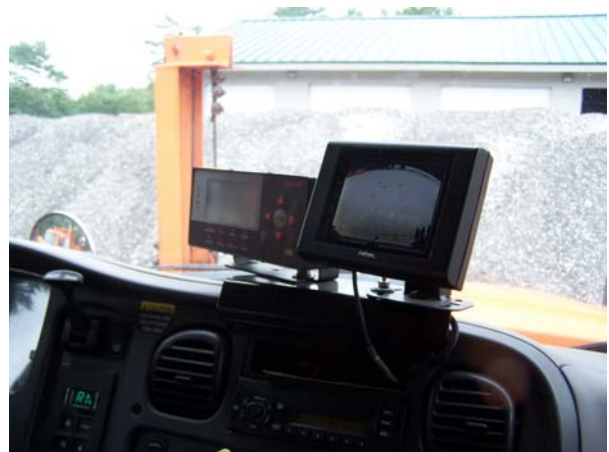
Figure 20: Turnpikes' Monitor