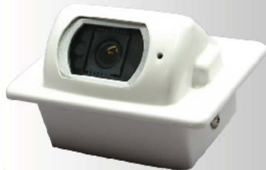
Shown above in the optional flush mount assembly