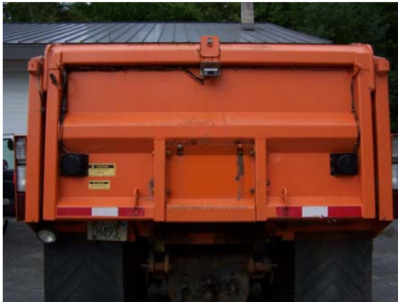
Figure 3: District 1 Camera and Radar

In Maintenance District 1, a 2006 Freightliner six-wheeled dump truck with a municipal body (does not require a spreader body insert) from the Butterhill/Franconia Patrol Section was selected. This vehicle plows several interstate ramps and as a consequence engages in frequent backing maneuvers for each run. The truck was outfitted with an Intec CVC240SHXL black/white camera with a shutter to cover the lens. In addition, an Intec CVSPV2020 pulse radar network consisting of two sensors and a wiring interface to enable the radar to operate with the camera system were installed. The monitor for this system was mounted in the cab of the truck between the seats at about seat height. The radar and camera are routed through an Intec CVS100XL single channel controller, and the monitor can be controlled with the CVR100 single channel remote. The radar is interfaced so that audible beeps are produced by the remote to indicate the proximity of the radar target to the vehicle. The monitor was Intec's CVD500LCD which is a 5" LCD display. The camera was mounted in the center of the tailgate on the body and the radar sensors were mounted on each side of the tailgate.