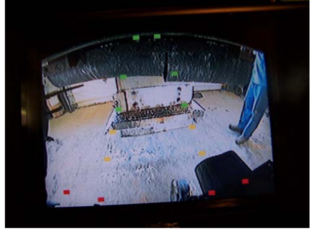
Figure 26: View with mud flaps up