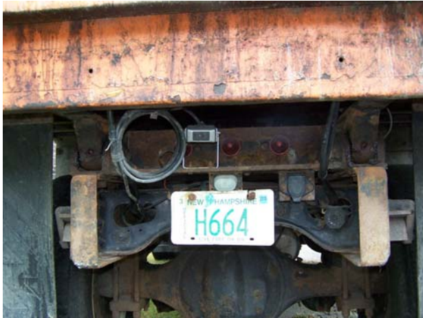
Figure 7: District 2 Camera

In Maintenance District 2, an International 4600 six-wheeled dump truck with a regular body from the Orford Patrol shed received an Intec CVC470HXL color camera, an Intec CVD640LCD 6.4 inch LCD color display, and an Intec CVS100XL single channel controller with the CVR100 remote control for the monitor. The remote control is mounted to the dashboard. This truck plows the Lyme Common that requires several backing maneuvers to complete. The monitor in this truck was mounted between the seats in front of the dashboard facing the driver. The camera was mounted 3 to 4 inches to the left of center above the pintle plate and below the dump body.