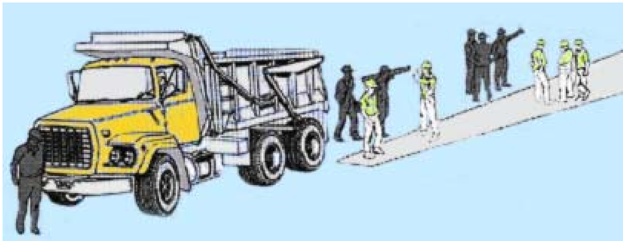
Figure 1: Darkened figures are in the dump truck driver's blind spot (NIOSH)

Every year thousands of accidents occur when a vehicle being backed strikes something or someone. The National Safety Council estimates that 25% of all accidents involve backing and approximately 500 fatalities occur each year due to these accidents. A significant portion of the fatalities involve children caught behind the vehicle. Large vehicles such as dump trucks have significant blind spots to the rear of the vehicle that make them more susceptible to backing accidents. In the illustration below from the National Institute for Occupational Safety and Health (NIOSH), the figures that are darkened represent people hidden in the blind spots of the vehicle.