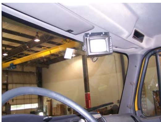
Figure 27: Town of Bow typical monitor installation

The Town has also dealt effectively with the problem of camera position and spreader installation at the back of the truck. A receiver-hitch type of installation has been devised that allows the camera to be quickly detached and reattached to the truck or the spreader. This setup is shown in Figures 28 and 29. The installation includes enough extra wire so that the camera doesn't need to be unplugged when moving it from the truck to the spreader. The extra wire is looped and tied under the truck when the camera is on the truck. The extra wire is looped and stored in one the light housings when the camera is on the spreader. Bow uses 40 feet of wire for its camera installations with trucks similar in size to NHDOT.