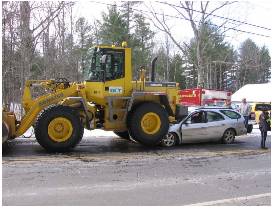
Figure 2: NHDOT backing accident in Holderness in 2005

none of the above-referenced accidents involved serious personal injury or death but the potential for such consequences is significant.