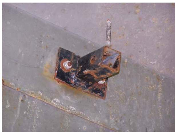
Figure 28: Town of Bow receiver-type attachment point

The Town has also dealt effectively with the problem of camera position and spreader installation at the back of the truck. A receiver-hitch type of installation has been devised that allows the camera to be quickly detached and reattached to the truck or the spreader. This setup is shown in Figures 28 and 29. The installation includes enough extra wire so that the camera doesn't need to be unplugged when moving it from the truck to the spreader. The extra wire is looped and tied under the truck when the camera is on the truck. The extra wire is looped and stored in one the light housings when the camera is on the spreader. Bow uses 40 feet of wire for its camera installations with trucks similar in size to NHDOT.