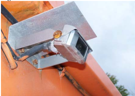
Figure 4: District 1 Camera