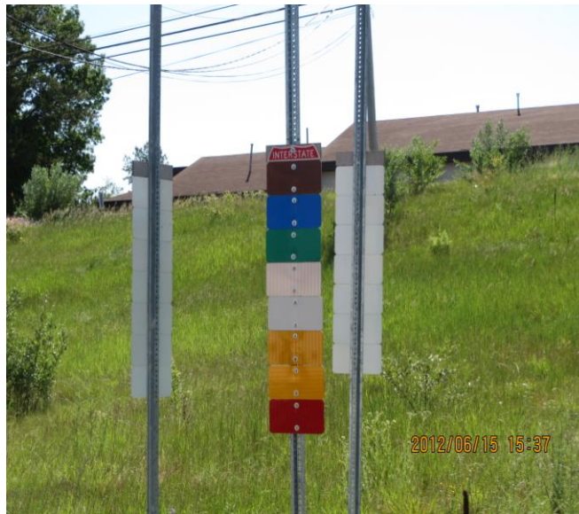
Figure 1: Sheeting field at Concord maintenance office.

sheeting field installed January 2, 2009 and a sample data set respectively. The sheets continue to be monitored for retroreflectivity.