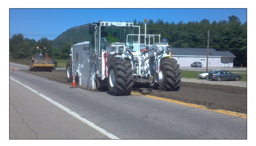
Figure 300 – 5: Reclaiming Stabilized Base Operations

Conservation of sand and gravel has resulted in the frequent re—use of existing bituminous pavements and base courses. Plans, typicals, and specifications will specify the area to be covered and the desired depth of reclaim stabilized base to be placed. Often this area is not the same as the existing paved area. Since the depth of the reclaiming process varies with pavement thickness, considerable care and effort must be taken to estimate the quantity of reclaim material that is being generated to ensure there is sufficient quantity to be placed on the new roadway.