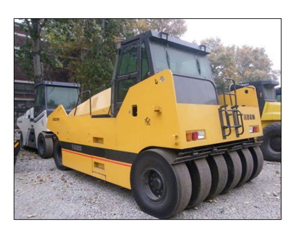
Figure 300 – 4: Subgrade Compaction with Rubber–Tired Roller

A carefully constructed, fully compacted base should be immediately fine graded for paving. The Contract Administrator should consult the Specifications for fine grading. The Contractor should not permit any hauling or traffic on the completed base course prior to paving.