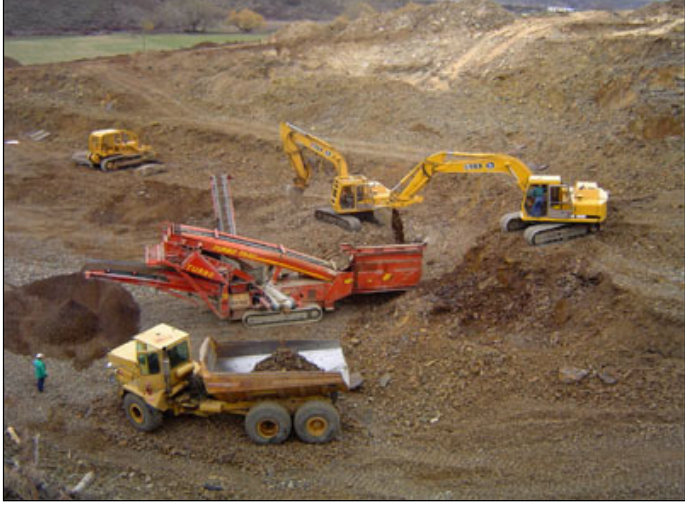
Figure 300 – 1: Gravel Pit Operations

It is not uncommon to see a contractor request to substitute gravel for the sand layer. This would normally be approved with the gravel in the sand layer to be paid at the sand price and the placement of the gravel to be in layers corresponding to acceptable compaction. The base courses are the foundation of the roadway and that the gradation of the select materials will dictate the performance of the roadway through time.