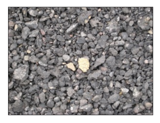
Figure 300 – 6: Reclaimed Stabilized Base Sample

In some projects the reclaimed material is required to meet a specific gradation and/or asphalt content specification. These projects should contain items for stone and asphalt to be used as necessary to ensure that the reclaimed material meet the specification.