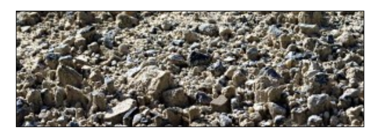
Figure 300 - 2: Gravel Sample

Current construction plans usually require sand, gravel, and crushed gravel for base course materials. Depletion of nearby gravel sources has necessitated an increased use of crushed stone base courses for major road projects. Contract Administrators should check the current <u>Standard Specifications</u> and Special Provisions for the latest material descriptions.