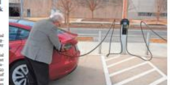
The Biden administration's intentions are to make electric vehicles accessible to everyday Americans.

The Transportation Department said it approved EV charger plans from a list of 17 states, triggering the release of $1.5 billion in federal funds to all jurisdictions nationwide — or $1 billion over five years — to install or upgrade chargers along 75,000 miles of highway from coast to coast, with a goal of 200,000 EV