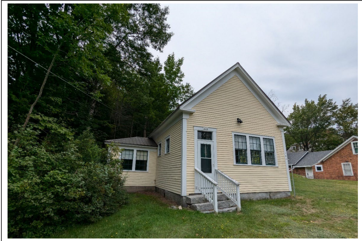
Photo # 4 Description (with direction): District #1 Schoolhouse/Randolph Public Library Annex facing northeast.