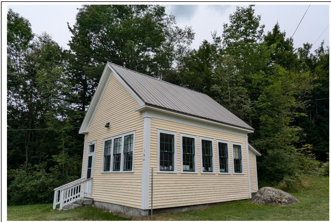
Photo #2 Description (with direction): District #1 Schoolhouse/Randolph Public Library Annex facing northwest.