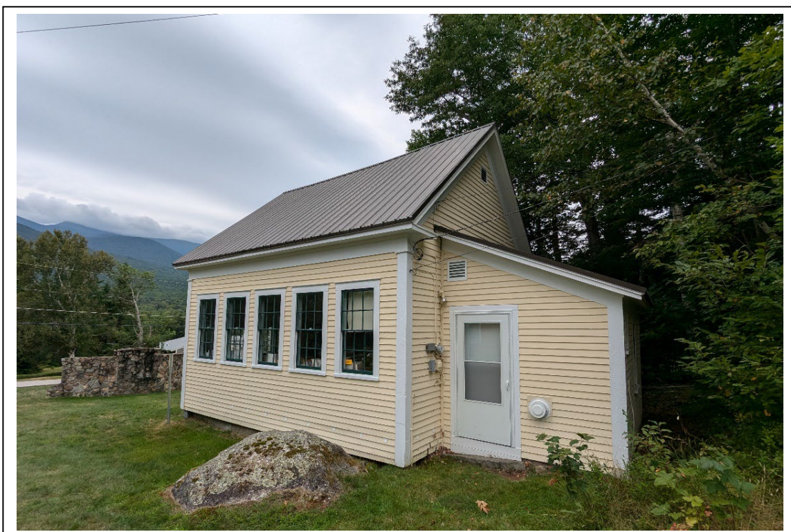
Photo #3 Description (with direction): District #1 Schoolhouse/Randolph Public Library Annex facing southeast.